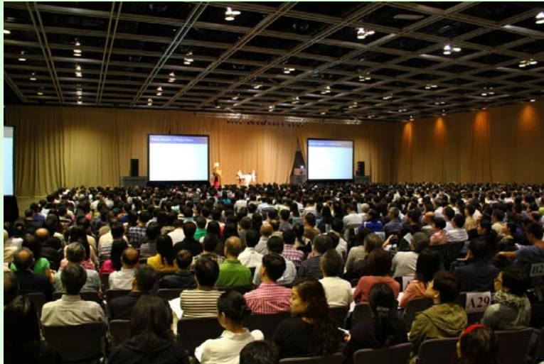
About 1,500 participants attended the seminar.