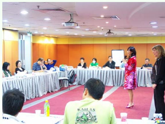
A family mediation training course organised by the Academy on 24-26 September 2009