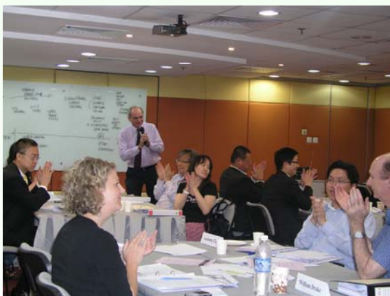
A general mediation training course organised by the Academy on 15 May 2009

The above courses provided training to a total of over 430 participants.