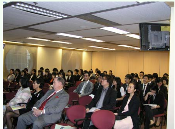
Participants at the sharing session held on 22 June 2009.