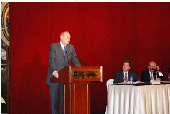
Mr Justice Anthony Kennedy speaking at the Seminar on “Human Rights and the Rule of Law” held by the Academy on 24 October 2008.

With the consent of the speakers, the seminar has been recorded and the speeches are posted on the Academy’s website freely accessible to the public.